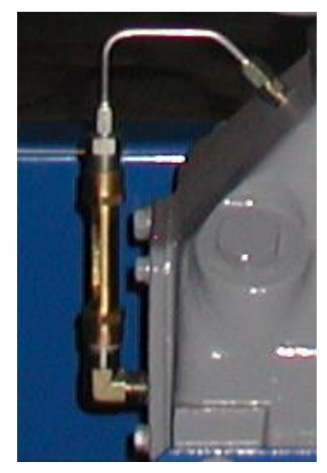
Oil Level Sight Glass