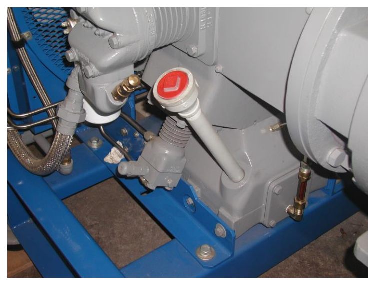
Oil fill extension & bell mouth