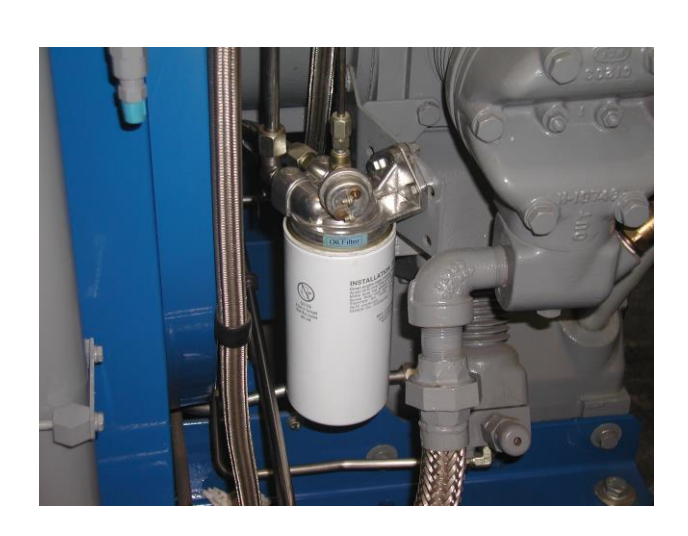
Spin Off Oil Filter